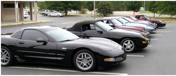
The Ozark bunch lines up before the Wine Fest fun run

One can get a real appreciation of the country life while taking in the breath-taking aroma of freshly cut hay and the application of liquid animal fertilizer. Even rolling up one's windows didn't spare us the odor. The only thing that seemed to work was for the lead car to speed up and allow the group to rapidly depart from the Green Acres experience of Yell County.