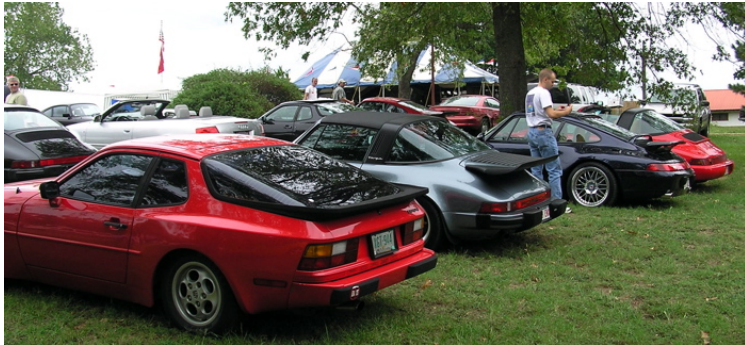
Our editor thinks of "swapping" his 'Vette for a 993 Turbo look Carrera

One can get a real appreciation of the country life while taking in the breath-taking aroma of freshly cut hay and the application of liquid animal fertilizer. Even rolling up one's windows didn't spare us the odor. The only thing that seemed to work was for the lead car to speed up and allow the group to rapidly depart from the Green Acres experience of Yell County.