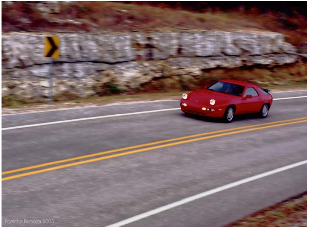
Porsche Palooza 2005