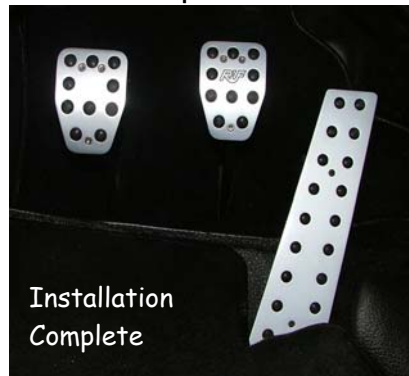
These sport pedals are available for most all Porsches. ENJOY!

Wayne Corley: 1-888-RUF-N-USA www.rufautocentre.com