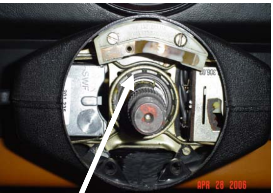
Steering wheel column bearing with retainer - Check for wear here by moving shaft.

I have removed two air bag equipped steering wheels, I am not sure I would recommend it for DIYers. Air bags can be dangerous if not handled properly during removal, storage, and installation. An air bag equipped wheel swap might be a job