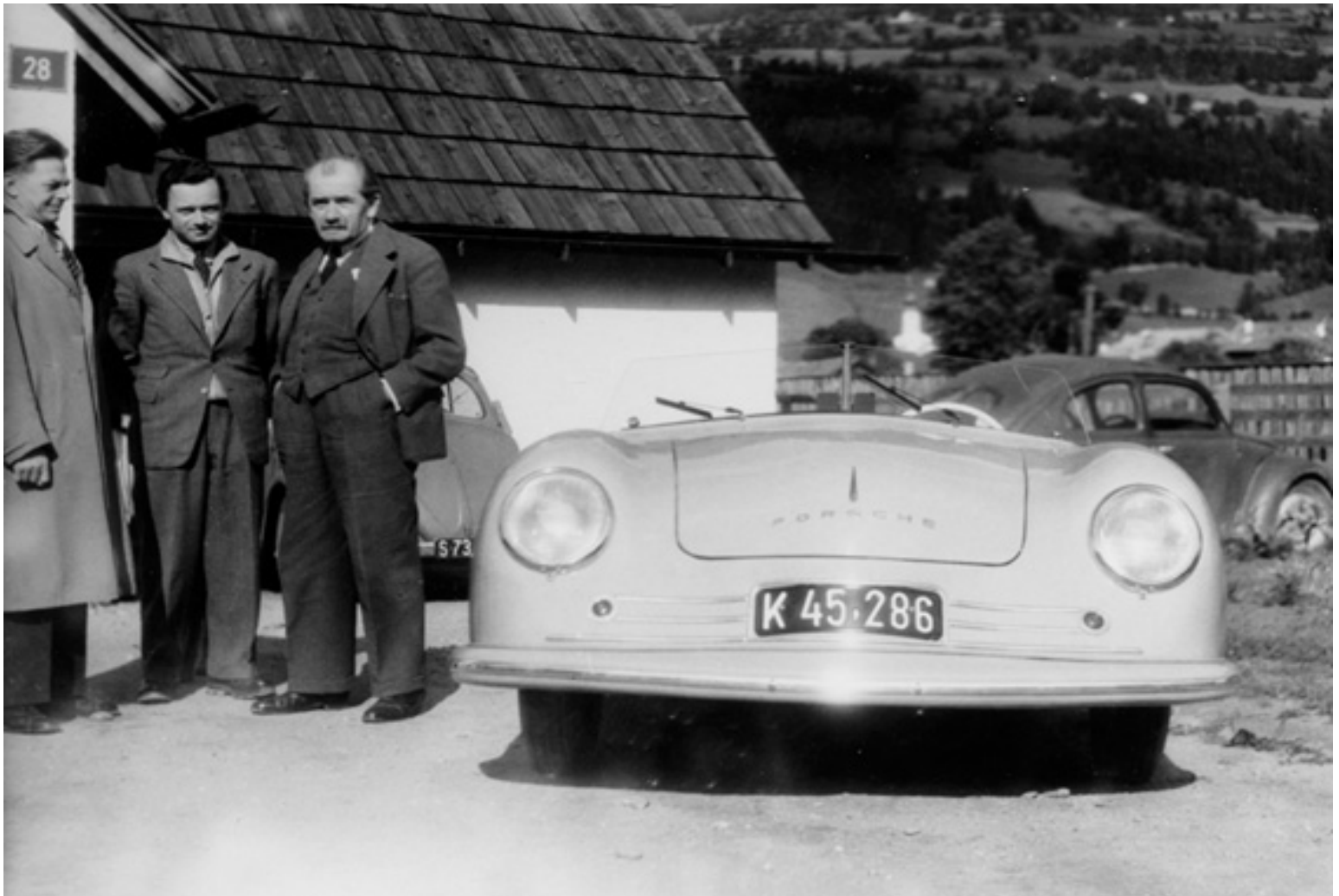
PORSCHE CELEBRATES 60 YEARS BY SHOWING THE MID-ENGINE 'PORSCHE NO. 1' SPORTS CAR THAT DR. FERRY PORSCHE BUILT WHEN HE COULD NOT FIND THE CAR OF HIS DREAMS (Continued on page 10)

The engine and transaxle were fitted into the frame in such a way that the engine ended up positioned in front of the rear axles with the transaxle trailing behind, making this a true mid-engine design. Mated to a four-speed gearbox, the drivetrain proved to be both lightweight and reliable. Erwin Komenda, who along with Ferry Porsche and Karl Rabe formed the foundation of the fledgling car company, penned an aerodynamic and easy-